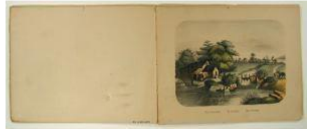
Unknown European, Paper-Covered Album of Hand-Colored Lithographs , 1800 – 1825, lithographs on paper in album, 6 1/2 in. x 8 1/4 in. x 2 13/16 in.

Based on the book A Place to Read by Leigh Hodgkinson, we will be making our own accordion style book. You can use your homemade book to write your own story, make sketches and art, or use it as a journal. Be sure to think about the cover of your book too. Here are a few examples of books from the Currier's collection.