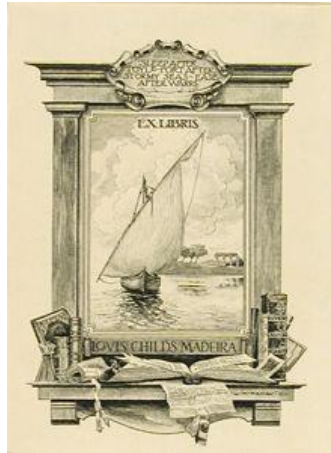
Walter Monteith Aikman, Bookplate of Louis Childs Madeira , 1911, engraving on paper, neutral black ink, 4 5/8 in. x 3 3/16 in., Gift of Arnold Cogswell