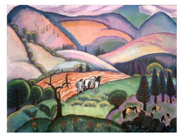
William Zorach, Plowing the Fields , 1917, oil on canvas, 24 in. x 36 in.

This oil painting depicts the hills of Plainfield, New Hampshire, where the Zorach and his wife summered at "Echo Farm" in 1917. Notice the stylized, undulating forms of the land, the intentionally elementary rendering of trees, animals and figures, and the vibrant, nonnaturalistic colors of the landscape, all of which reflect Zorach's embrace of French modern art.