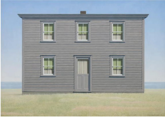
Christopher Pratt, House in August , 1969, oil on board, 17 ½ x 24 ½ in.

Using the work of Christopher Pratt (left) and inspirations from Frank Lloyd Wright (famous architect known for creating buildings that connected with nature in unique ways), we invite you to make a colored pencil drawing of your dream house. Think about what Pratt's work may say about the inhabitant and what you would want the front of your house to say about you! What shape and size would you want your house to be?