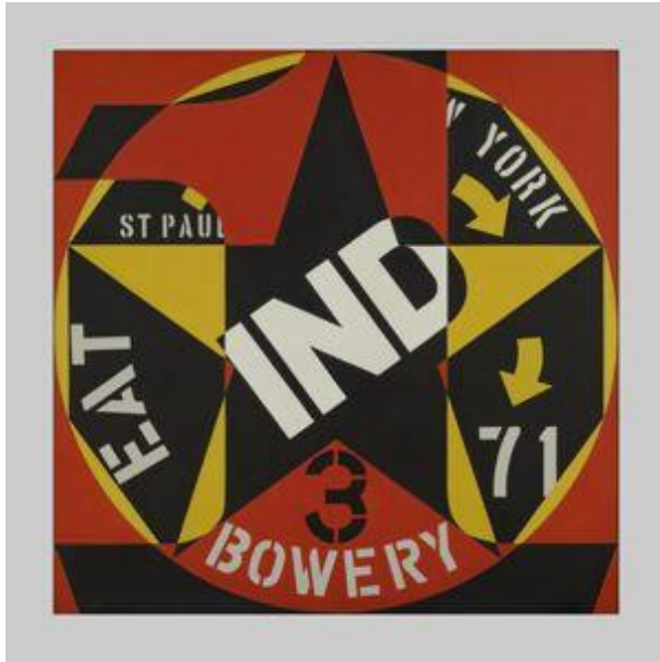
Robert Indiana, Decade Autoportrait 1963 , 1971, oil on canvas, 48 x 48"

Decade: Autoportrait 1963 is one of ten paintings that Indiana created in 1971, as meditations upon the time he spent in Manhattan during the 1960s when he gained international fame.