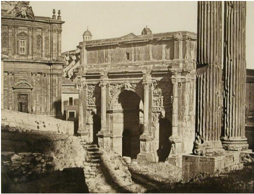
Eugène Constant, Roman Forum , circa 1850, salt print, 6 1/2 in. x 8 1/2 in., The Henry Melville Fuller Acquisition Fund.

Salt has been used by artists in a variety of ways. For example, salt played an important role in photography in the mid-1800s. The salted paper technique, created by Henry Fox Talbot, relied on light sensitive paper. It was created by wetting a sheet of paper with a weak solution of regular table salt, blotting and drying it, then brushing one side with a strong solution of silver nitrate. This produced a strong layer of silver chloride which is very sensitive to light. When a negative (film showing image with dark areas as light and light areas as dark) was placed over the paper and exposed to light the paper darkened where it was exposed to light, creating a photograph. You can see more salt prints in the Currier's collection here .