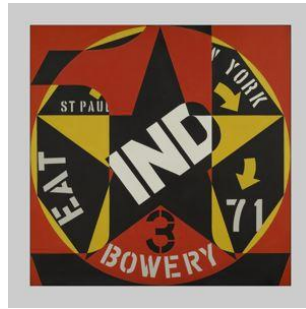
Robert Indiana , Decade Autoportrait 1963 , 1971, oil on canvas, 48 x 48"