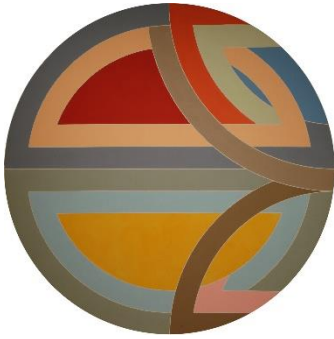
Frank Stella , Sinjerli, Variation I , 1968. Acrylic on canvas, 120 in. x 120 in.

Many artists use tools to help them make their work, especially artists who create very straight and even lines. Frank Stella used a protractor, Indiana used stencils and Richard Anuszkiewicz used tape. Each of these artists created many paintings using these tools, constantly practicing and modifying their technique. Get creative with this easy to do painting project using painters tape. Try it a few times and see how your technique changes as you practice and reflect on each work you make.