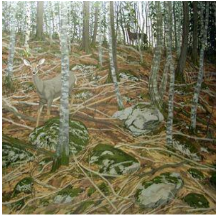
Neil G. Welliver, Deer on East Bank , 1980. Oil on canvas, 96 in. x 96 in. (243.84 cm x 243.84 cm)

Create a colorful forest landscape using marker, glue, and collage.