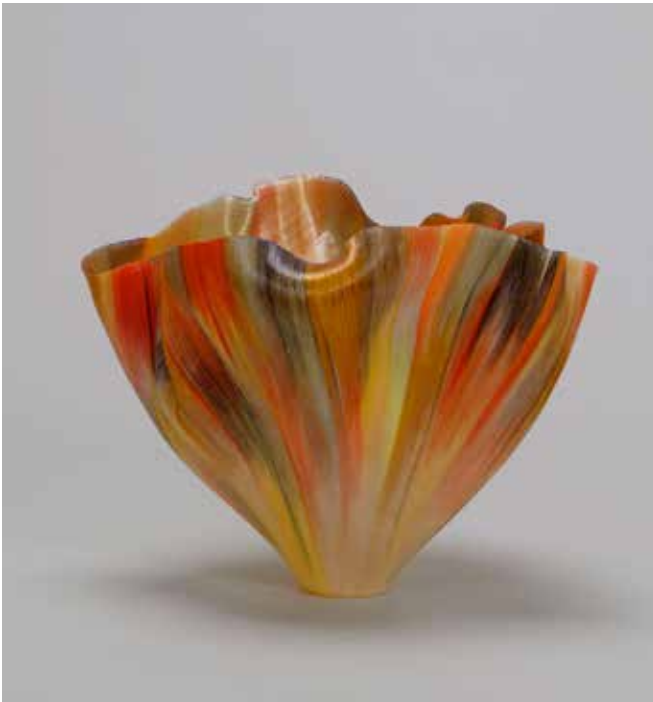
Toots Zynsky, Intermezzo , 2012, fused and thermo formed glass threads