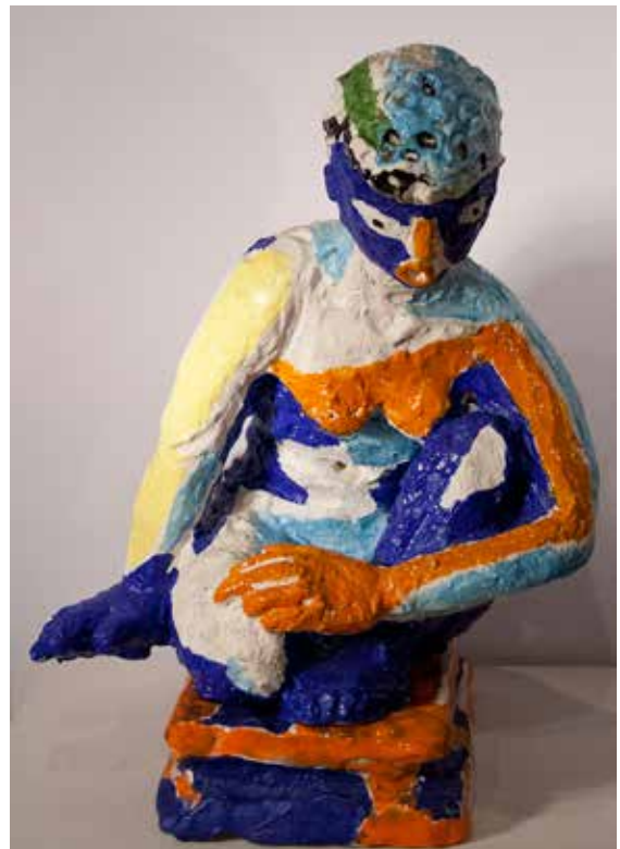
Art © Artists' Legacy Foundation / Licensed by VAGA, New York, NY

Raking Light , etching plate with artist's proof, zinc (plate), etching and aquatint (artist's proof) 2013.28.1