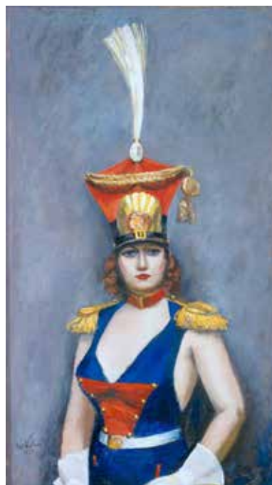
Walt Kuhn, Lancer , 1939, Oil on canvas

Gouache on paper, Museum Purchase: The Henry Melville Fuller Acquisition Fund, 2012.21