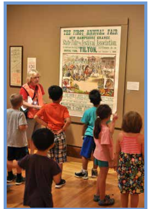
Art center students tour Poster Mania! Leisure, Romance and Adventure in 1890's America exhibition.