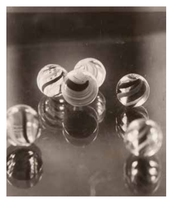
Ruth Jacobi, Little People (Marbles), c. 1930, gelatin silver print.

Little People (Marbles), c. 1930, gelatin silver print