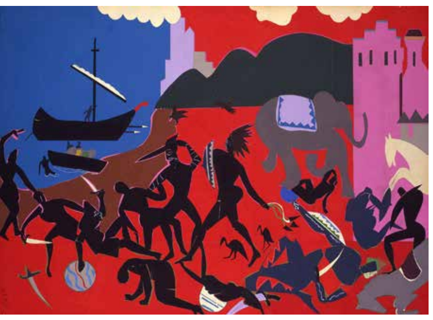
Romare Bearden, Battle with Cicones, 1977, collage of various papers with graphite on fiberboard.

Persistence of Memory #12, 2000-2001, chromogenic print and linen tape 2012.36