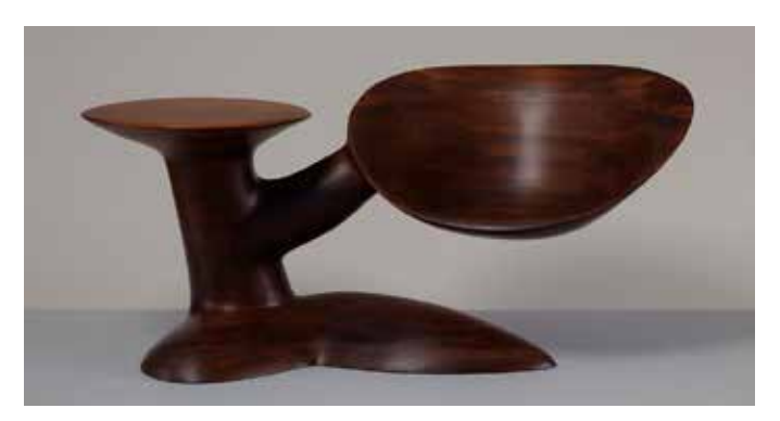
Wendell Castle, Distant Thunder, 2011, Peruvian walnut with oil finish.