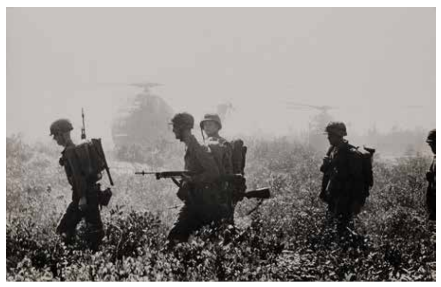
Don McCullin, Soldiers with Helicopter, Hue, Vietnam, 1968, gelatin silver print.