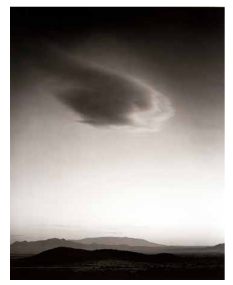
Paul Caponigro, Cloud over San Sebastian, Sante Fe, NM , 1980, gelatin silver print.

Prayer Flags, Yunnan, China, 2005 (printed 2011), archival pigment inkjet print