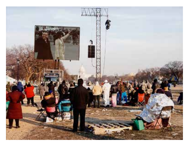
Catherine Opie,, Untitled #1 (Jan. 20th, 2009), chromogenic print.

Rooftops, Sept. 11, 1970, gelatin silver print 2012.6