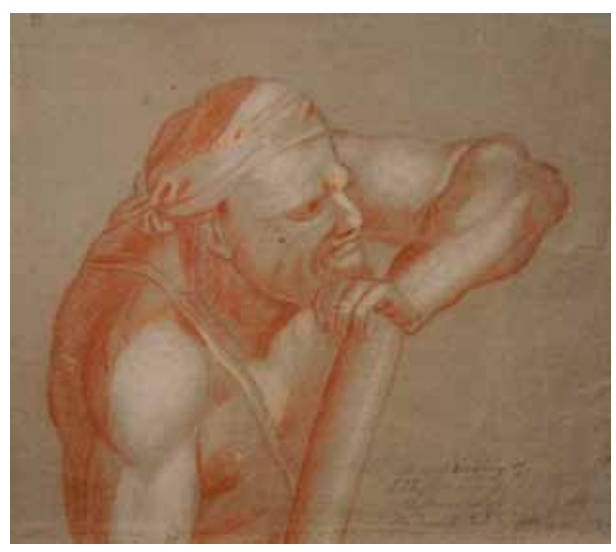
Figure from Battle of the River Granicus after Charles LeBrun, c. 1753-58, John Singleton Copley, conte crayon on green paper. Bequest of Eunice L. Shaer.