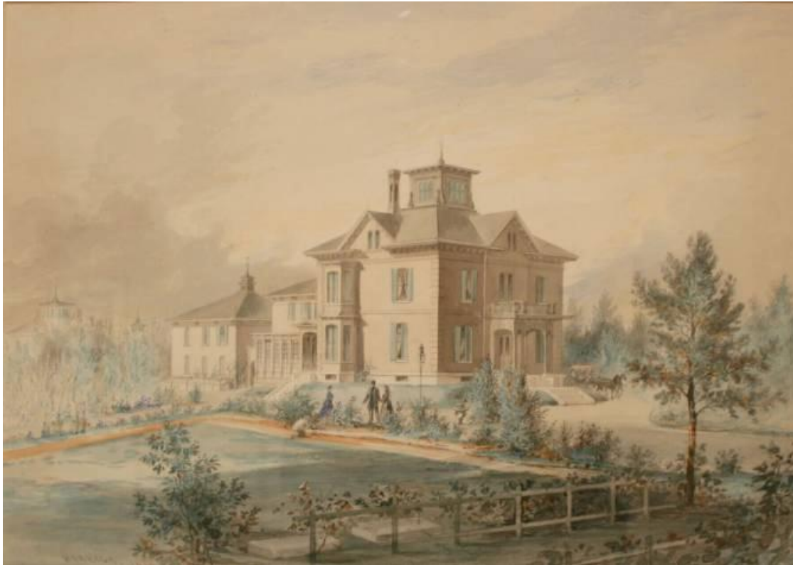
The Currier Mansion, about 1874