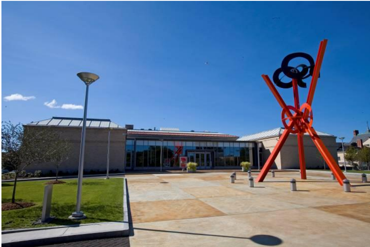
The Museum Entrance